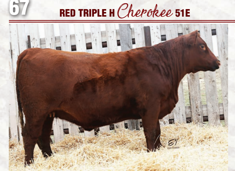
LOT 67 - RED TRIPLE H CHEROKEE 51E

Consigned By Triple H Cattle Co. Ltd., Cupar, SK