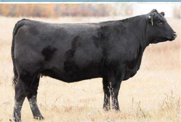
LOT 36 - J SQUARE S ENCHANTRESS 726E

Consigned By J Square S Angus, Grayson, SK