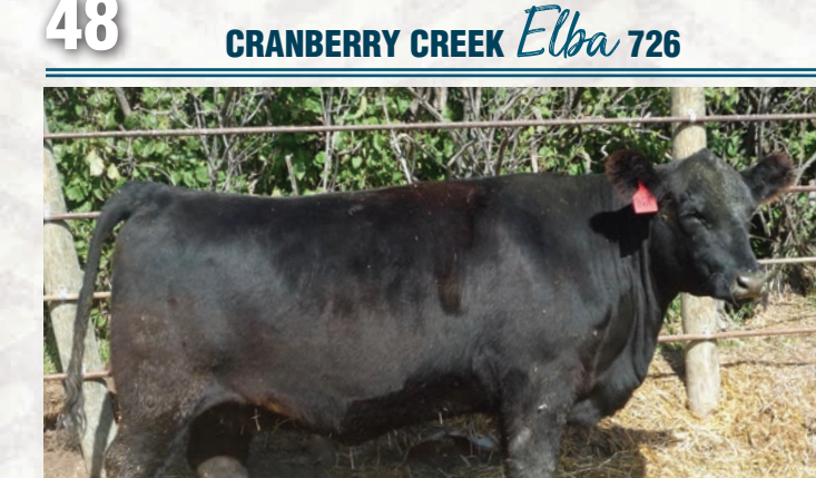
LOT 48 - CRANBERRY CREEK ELBA 726

Consigned By Cranberry Creek Angus, Boissevain, MB