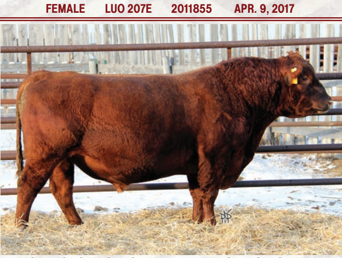
SERVICE SIRE OF LOT 74 - RED FLYING KING K GALAXY 57B

Consigned By Moose Creek Red Angus, Kisbey, SK