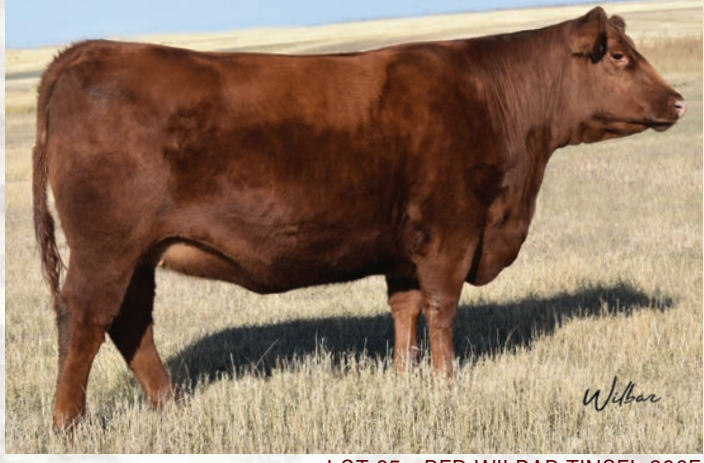
- RED WILBAR TINSEL 296E LOT 65