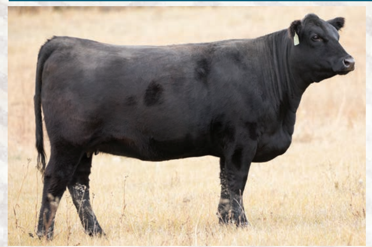
1 OT 34 - J SQUARE S DINTER PRIDE 700E