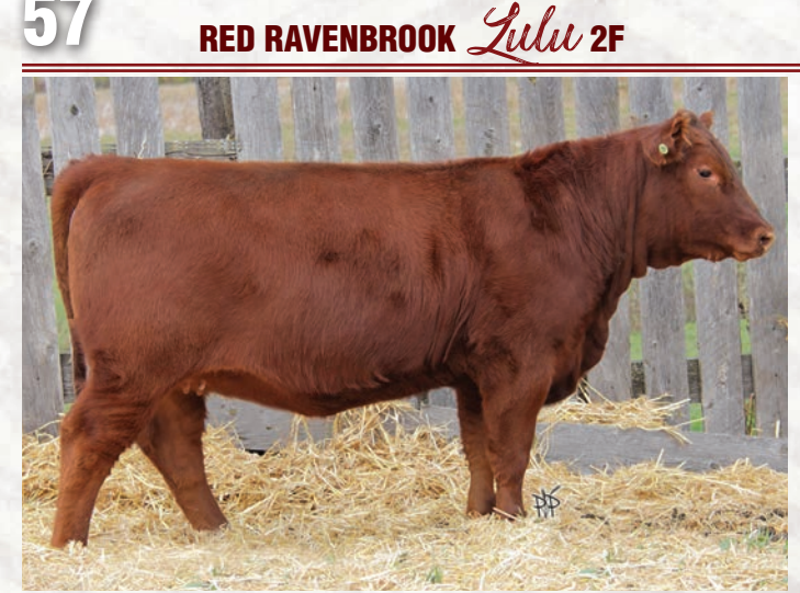
LOT 57 - RED RAVENBROOK LULU 2F